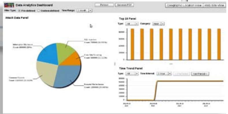
Analyze user geographic location and web site access based on Hit, Data and Attack vectors.

The Auto-Learn profiling capability is completely transparent and does not require any changes to the application or network architecture. FortiWeb does not scan the application in order to build the profile, but rather analyzes the traffic as it monitors it flowing to the application. By creating a comprehensive security model of the application FortiWeb can now protect against any known or unknown vulnerabilities, zero day attacks.